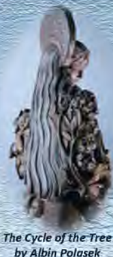
The Cycle of the Tree by Albin Polasek