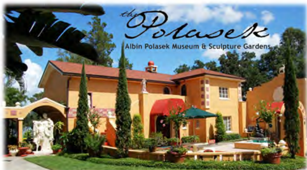
Albin Polasek Museum & Sculpture Gardens 633 Osceola Ave., Winter Park, Florida 32789