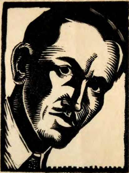
"Self Portrait" by Charles Turzak