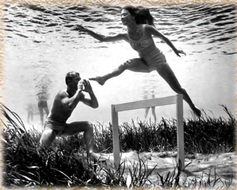
"Silver Springs The Underwater Photography of Bruce Mozart"